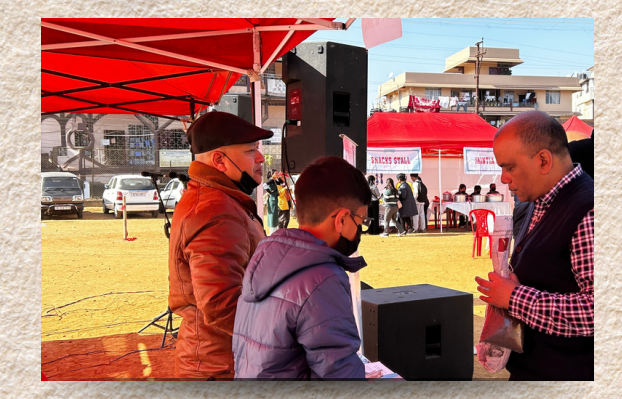
RTB | APAC's Book Stall at Reach Shillong Ministries Christmas Market